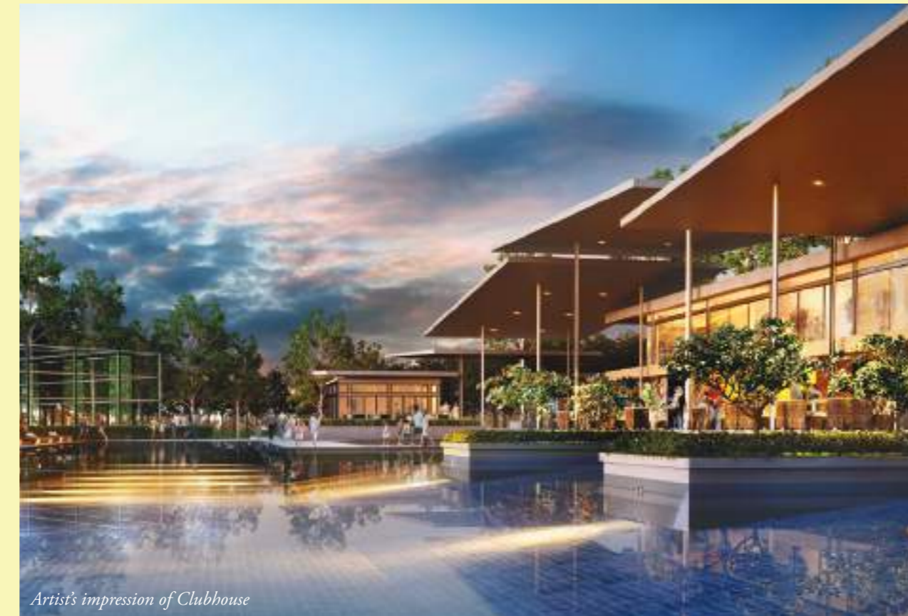
Artist's impression of Clubhouse

Within easy reach of the CLERMONT offers a wide array of amenities which will define the exuberant lifestyle of its residents.