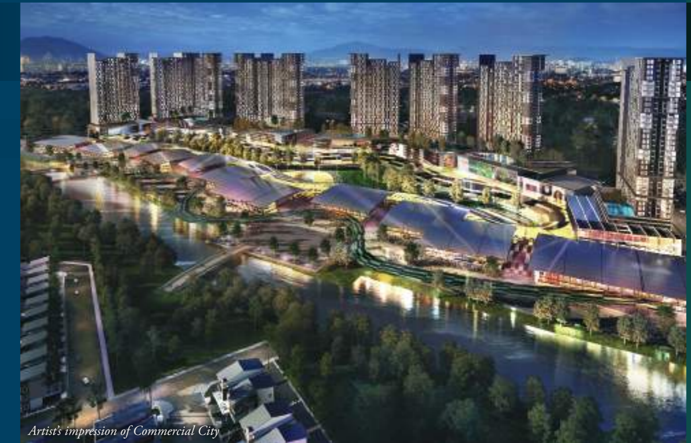
Artist's impression of Commercial City