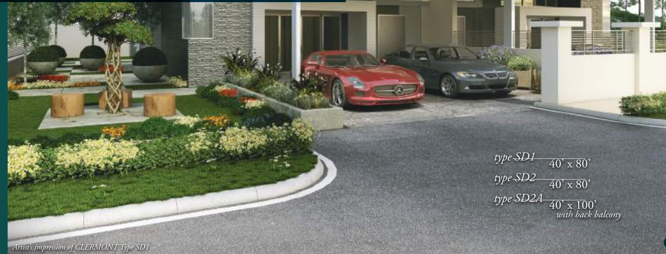
Artist's impression of CLERMONT Type SD1

type SD1— 40' x 80' type SD2— 40' x 80' type SD2A— 40' x 100' with back balcony